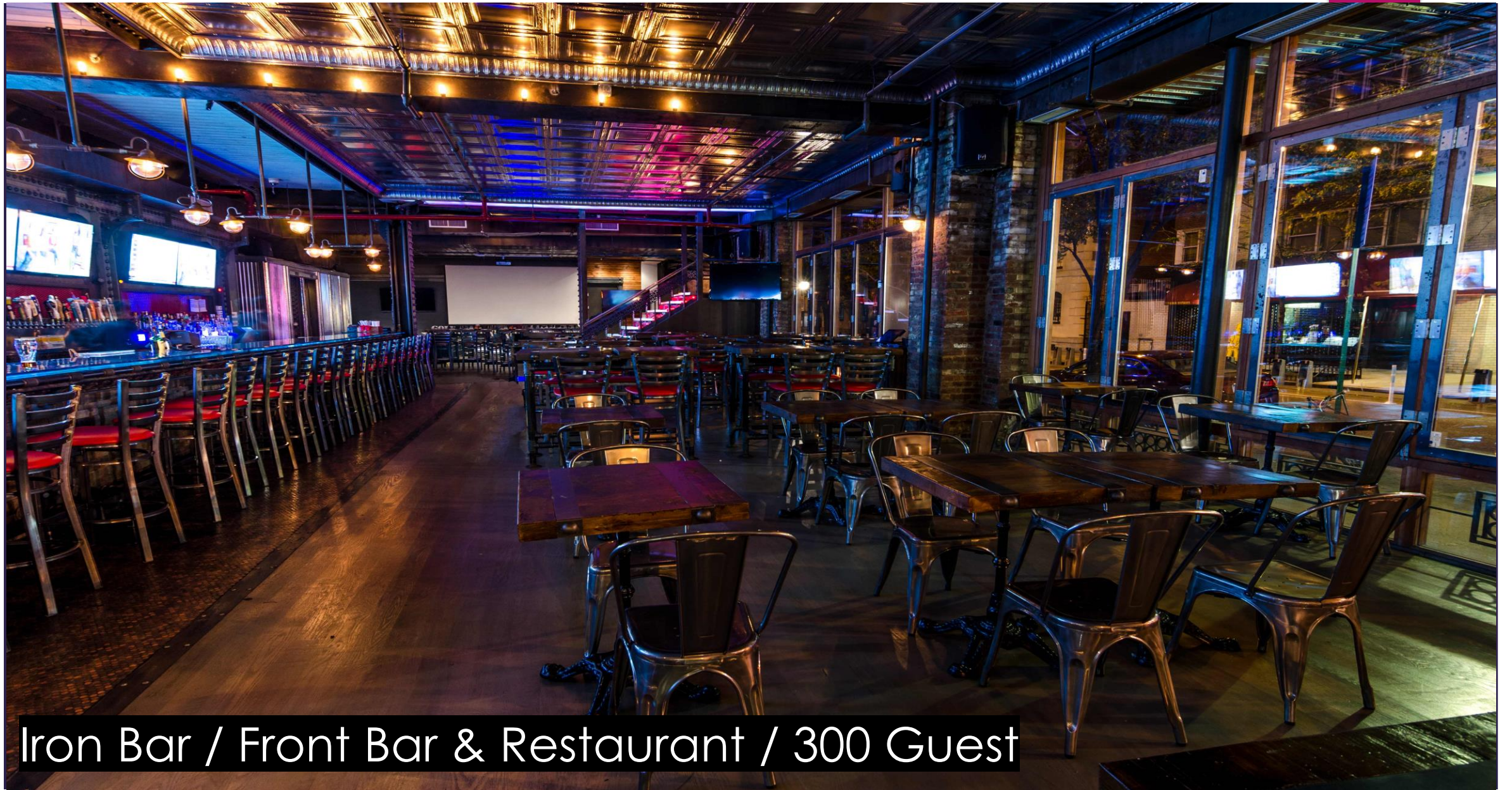
Iron Bar / Front Bar & Restaurant / 300 Guest