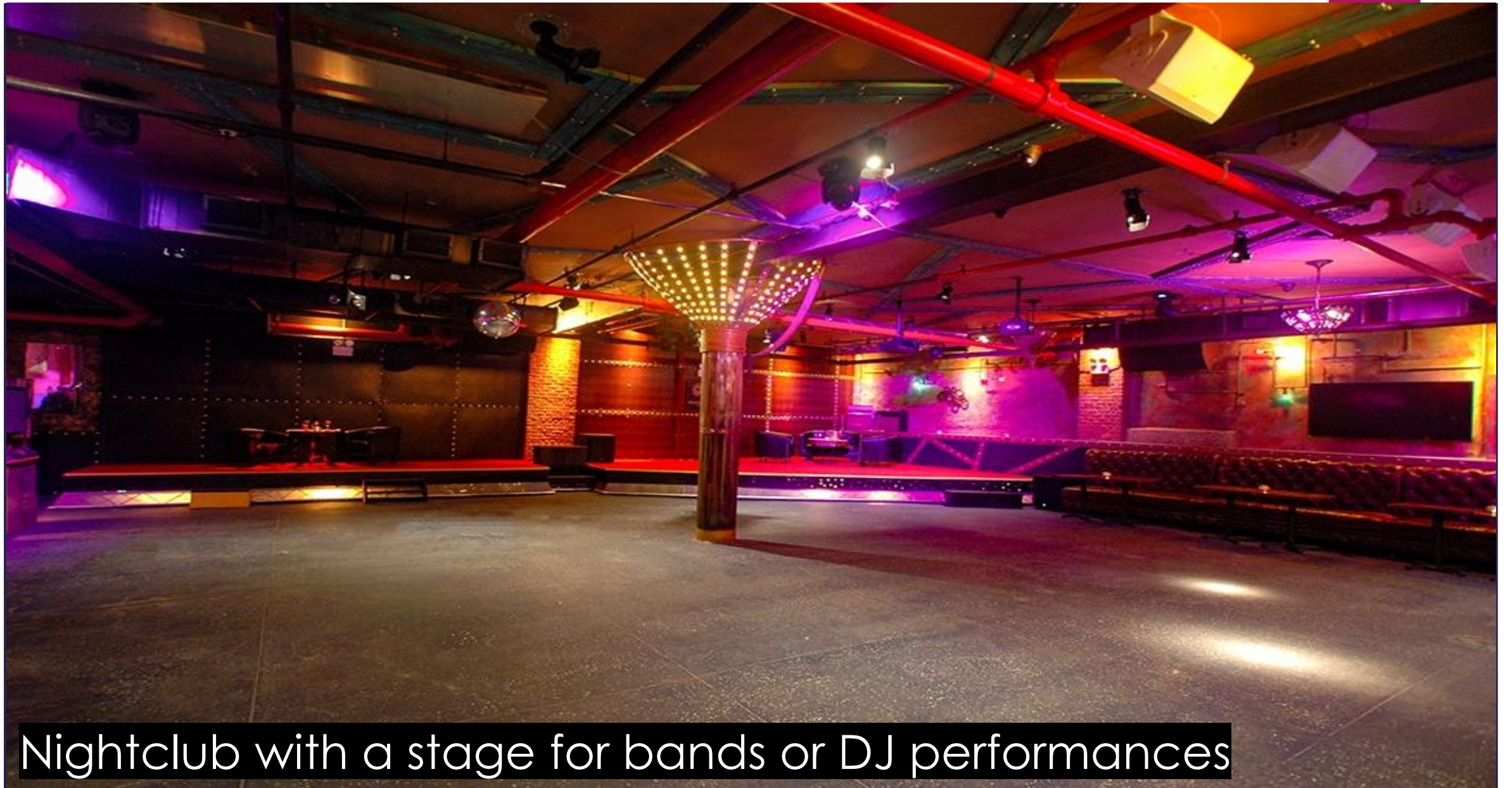
Nightclub with a stage for bands or DJ performances