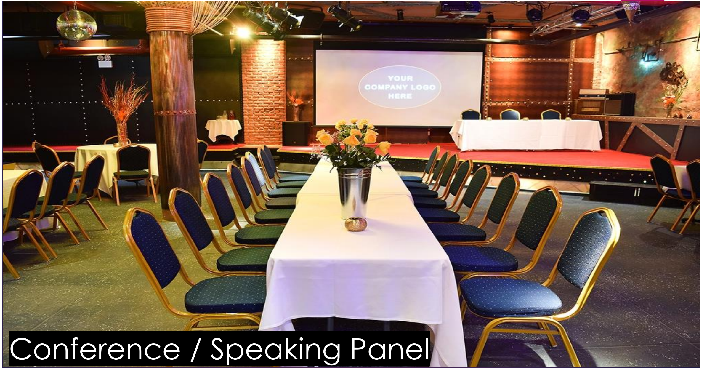
Conference / Speaking Panel