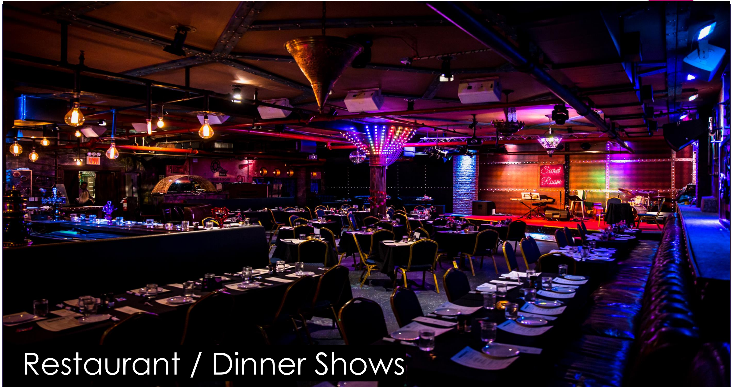
Restaurant / Dinner Shows