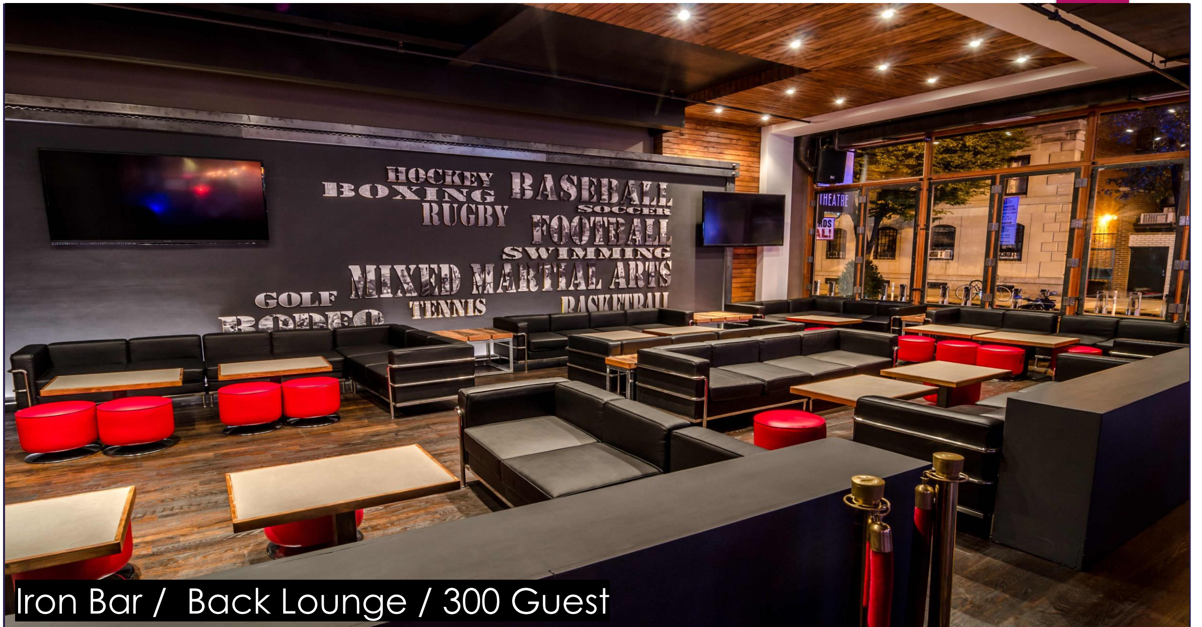
Iron Bar / Back Lounge / 300 Guest